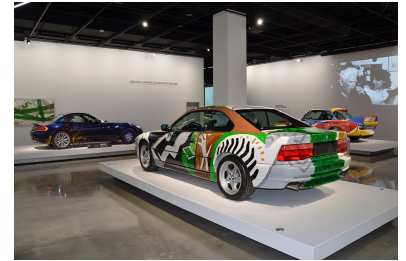
THE BMW ART CAR GALLERY FIRST FLOOR