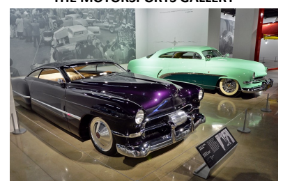
CADZILLA AND THE HIROHATA MERCURY