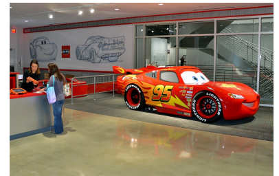
THE PIXAR CARS MECHANICAL INSTITUTE