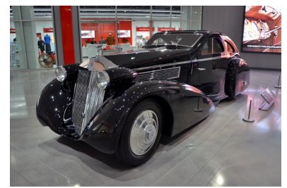
THE ROUND DOOR ROLLS IN THE LOBBY

TMPCC Media is a division of The Television Motion Picture Car Club, the world's only car club for those who work in or are affiliated with the entertainment industry. The club not only has members from the television and motion picture industry, but also includes those from music, radio, sports, motorsports and the automotive media. TMPCC has attracted some of the best automotive writers, reporters and photographers from print, TMPCC and television not only here in the United States, but from around the world. With all that talent on board, in late 2013 TMPCC Media was founded to help promote the automotive lifestyle.