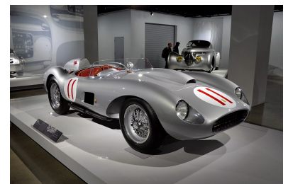
1957 FERRARI 625/250 TESTA ROSSA