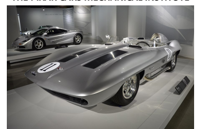
1959 CHEVROLET CORVETTE XP-87