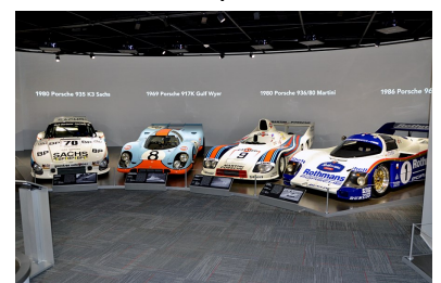
THE MOTORSPORTS GALLERY